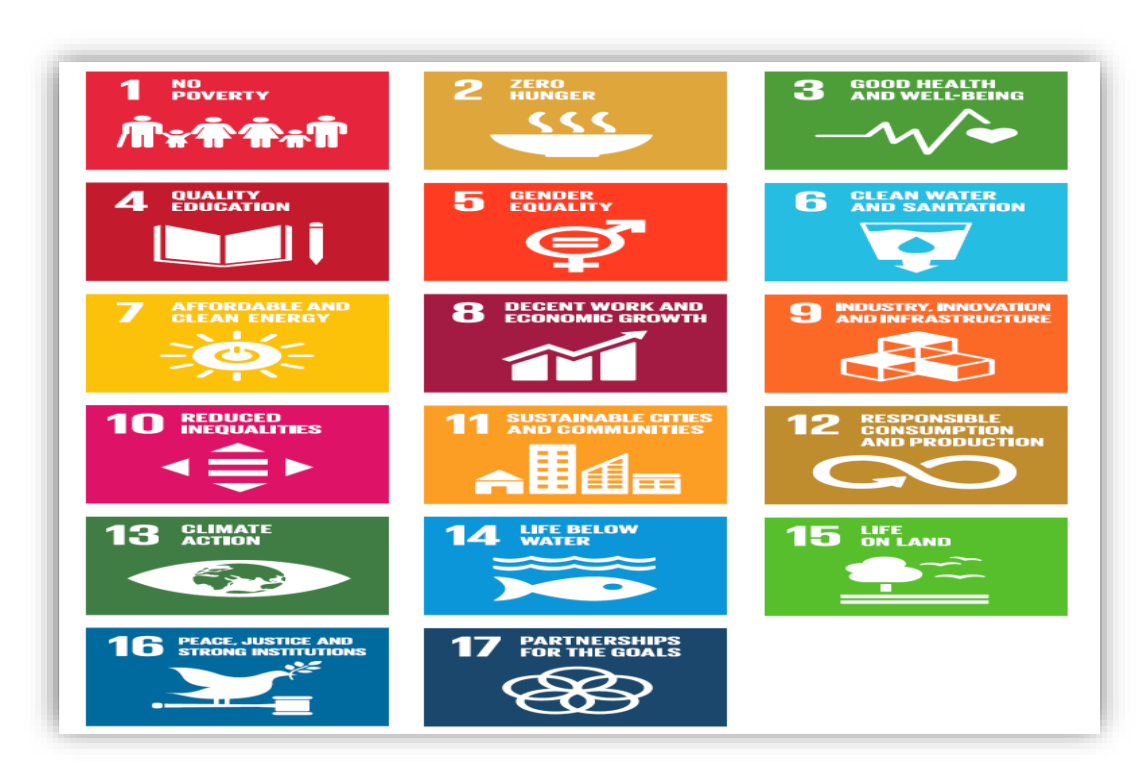
Figure 1: UN Sustainable Development Goals